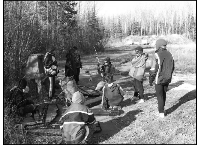
Giving safety instructions