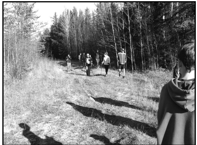
Preparing for beginning of relay

After an evening of fun games and socializing the camp wrapped up with a large group work out, ski walk and fun relay. The relay began with some great shooting by the shooters for the five teams followed by a run to the school's track and finished with a 4 x 100 meter relay.