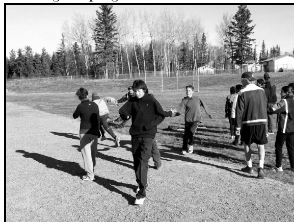
Tagging off for the 4 x 100 relay

The camp was very successful and the Minahik Waskahigan Ski Club would like to thank all the participants, coaches, parents and volunteers for all of their help. They would also like to thank CCS for financial support through the professional services grant program.