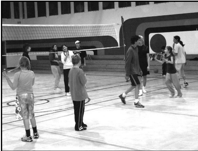
Some free time