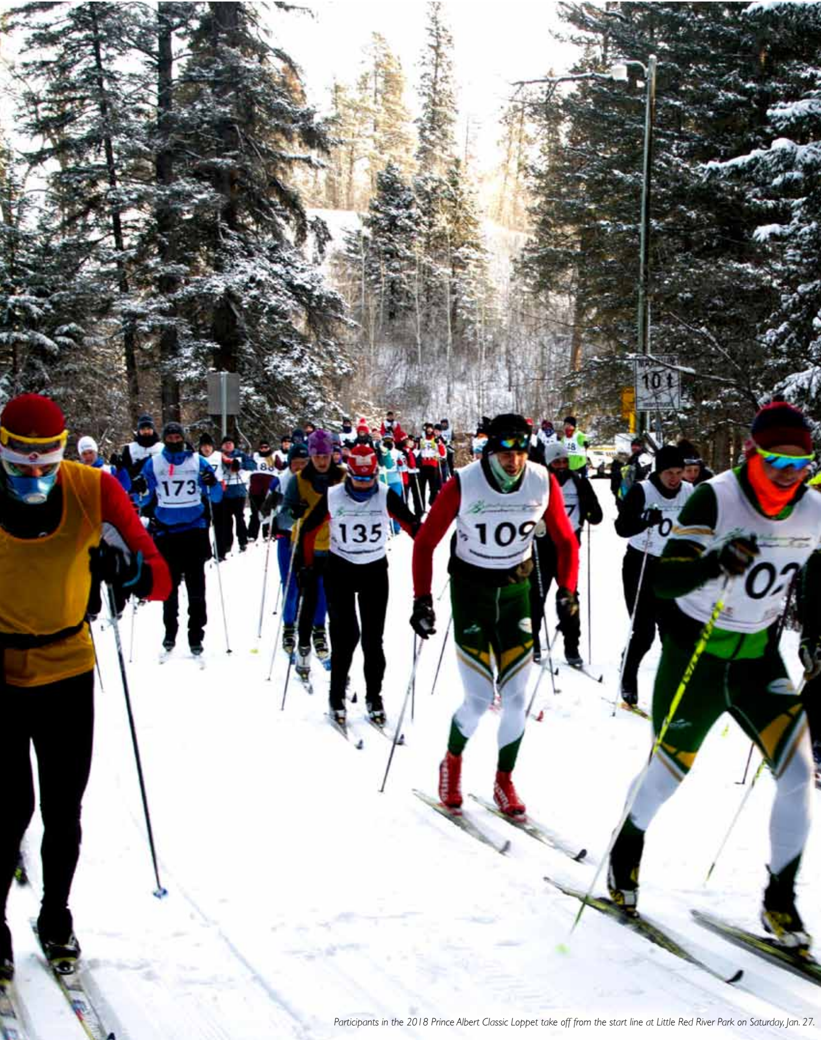
Participants in the 2018 Prince Albert Classic Loppet take off from the start line at Little Red River Park on Saturday, Jan. 27.