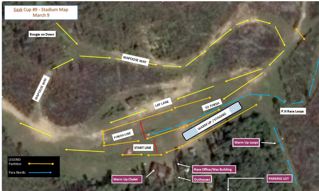
Green - 3km Loop Red - 2km loop Don Allen Ski Trails Map—Sask Cup #9 - Sat. March 9/24